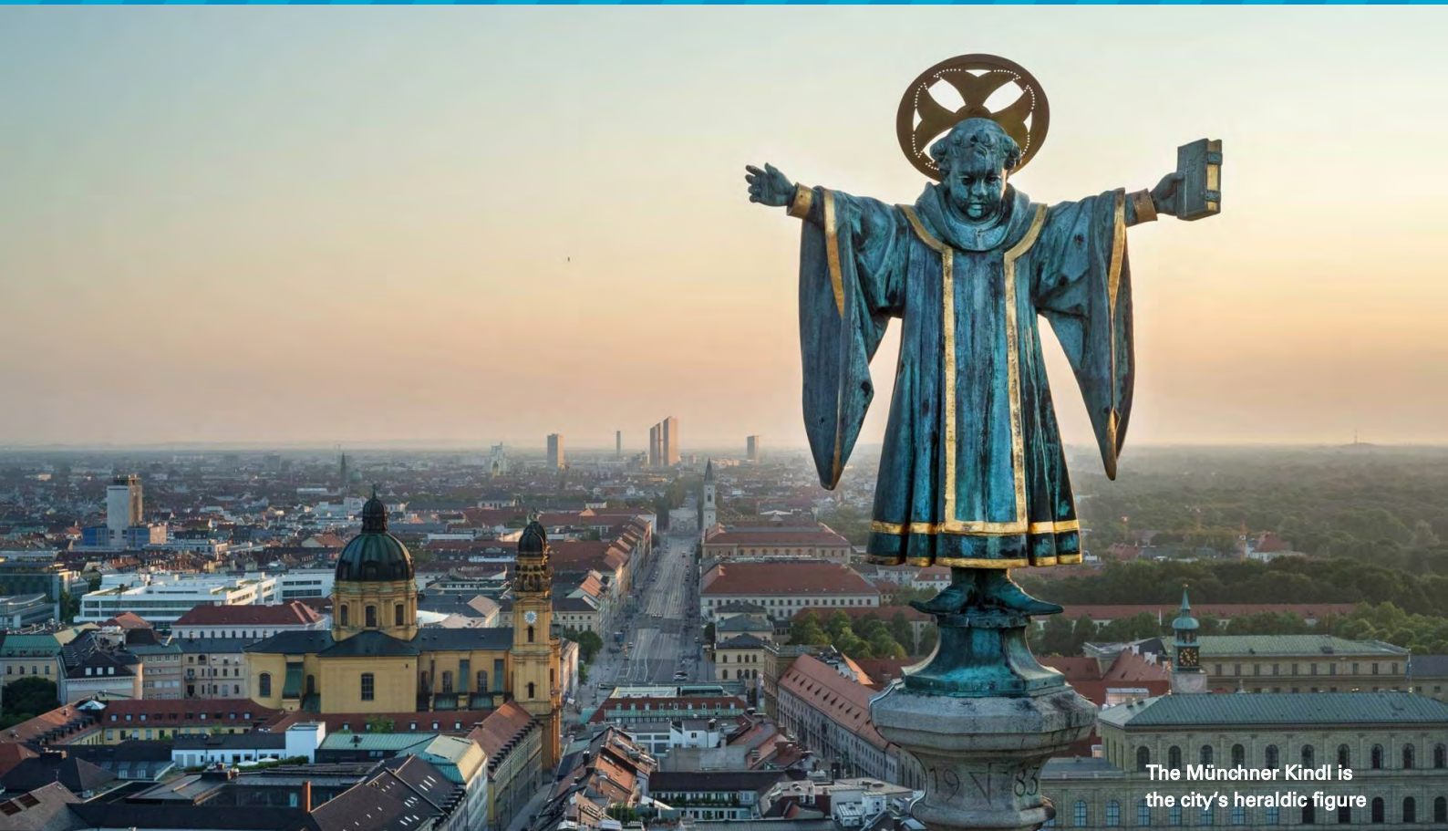
The Münchner Kindl is the city's heraldic figure