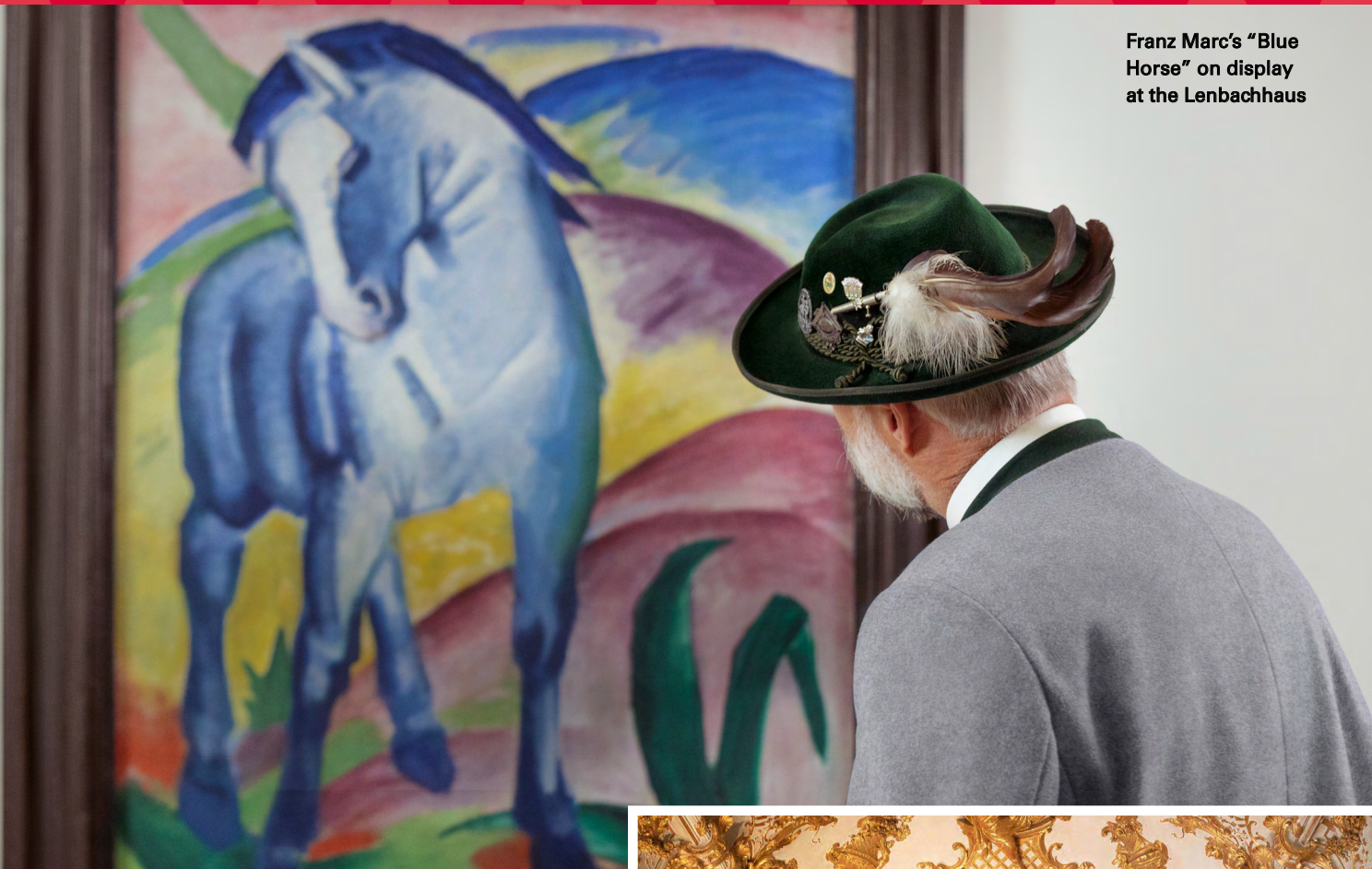
Franz Marc's "Blue Horse" on display at the Lenbachhaus